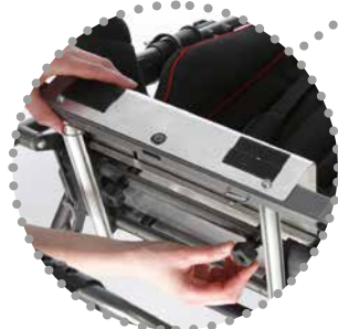
Seat depth adjustable without tools – even while the child is sitting in the rehab stroller (only for size 1)