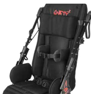
Head pillow, lateral trunk support with chest belt and 2-point pelvic harness (shown on size 2)