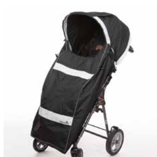
Sun and rain cover with leg blanket (shown on size 2)