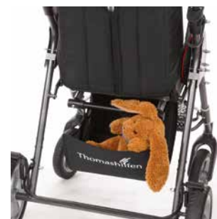
Basket (shown on size 1)