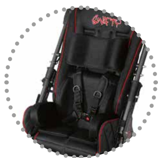
Seat minimizer for smaller children (accessory) – grows with your child for a very long time