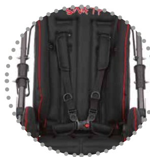
H-belt with padded harness as a standard feature

Comfortable sitting for the child: the washable seat cover is soft and breathable – preventing perspiration and providing a thoroughly cozy feeling