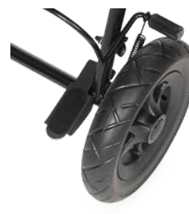
Tip assist (shown on size 2)

You will find the total overview of all accessories in the order form or on our website: www.thomashilfen.com