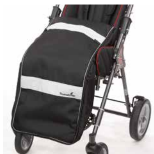
Sleeping bag, padded (summer) or woven fur (winter) (shown on size 1)