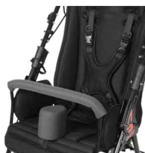
Butterfly chest harness (flexible), abduction block and grip rail (shown on size 2)