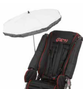
Umbrella and frame padding (shown on size 1)