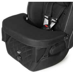
TABLE promotes the straightening up and stable posture of the child, provides the child with all-round support and safety